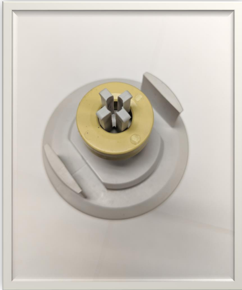
OEM Part # 404-067s